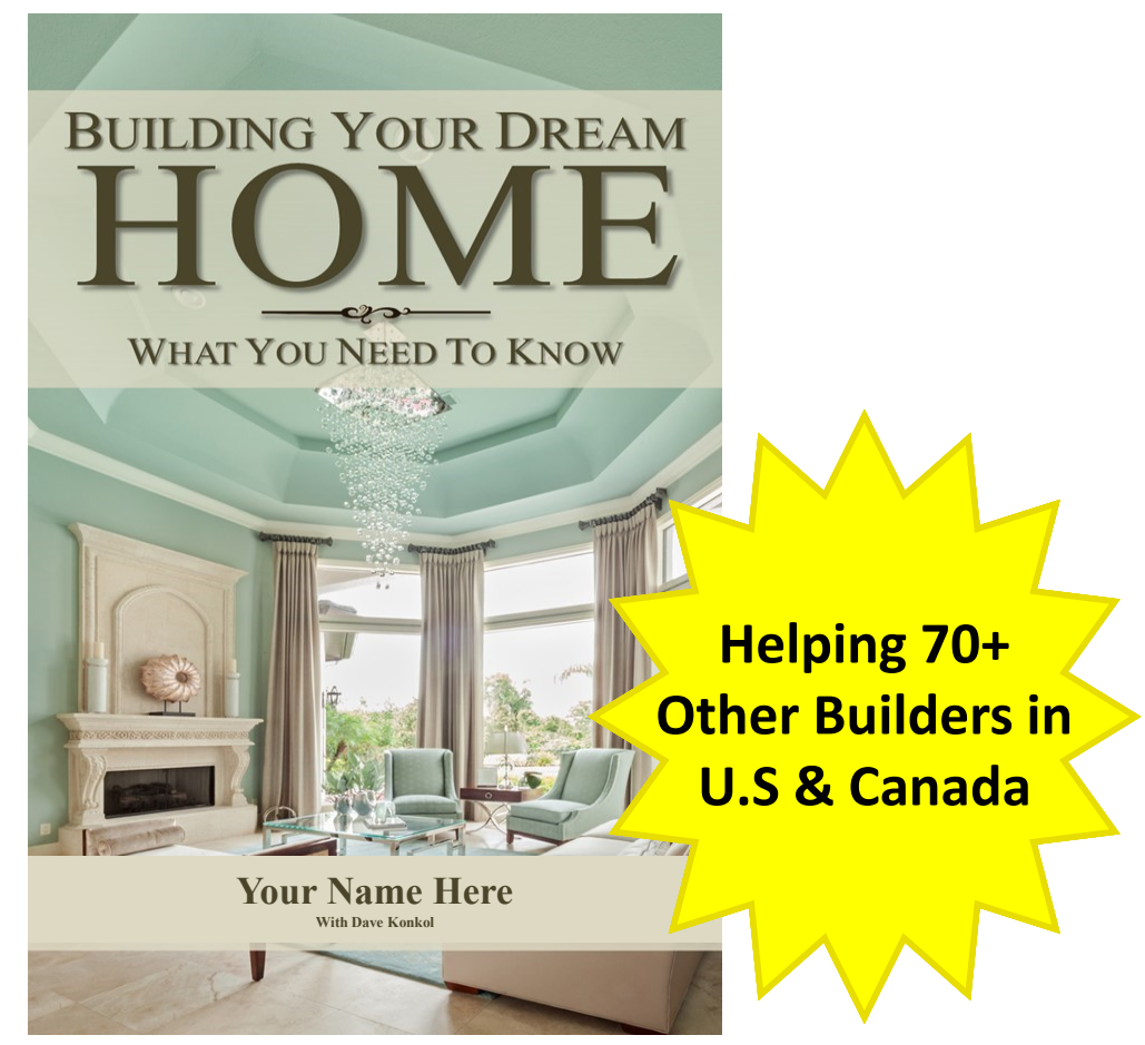
Graphics, Templates and Letters Included!